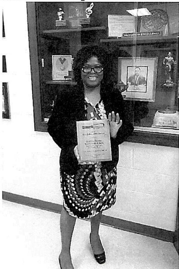
Exhibit A: 2019 Magnet School of Distinction